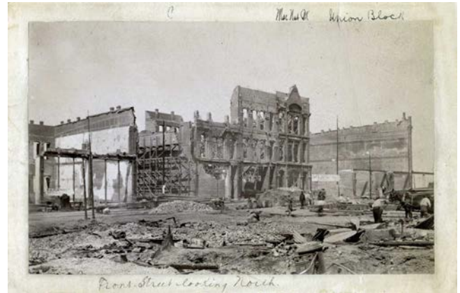
Photograph taken after the 1889 fire in Seattle

catastrophic fire in 1889 burned down 65 acres of Seattle's downtown for lack of water to put it out. Citizens had had enough and they made the decision to invest in re-building the infrastructure required to secure a safe, healthy and abundant supply of clean water.