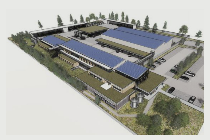
King County Parks Renton Operations and Maintenance Shop

In the case of Santa Monica, one motivated public servant and Collaborative member introduced an ordinance as a simple four-page Administrative Instruction, assisting with the need for a lengthy legislative process.