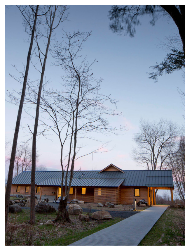
Living Certified Bechtel Environmental Center Whately, MA

The following incentives have been utilized in communities around the country in order to encourage the development of green buildings. You may find that some of them are in place in your community at this very moment. Historically, these incentives have been used for various green building programs and for individual green building strategies, such as energy or water efficiency improvements. If your community is already offering one of these incentives for developers, discuss adapting it to encourage the Living Building and Community Challenges as well. In order to encourage LBC and LCC projects, the strength of the incentives should match the additional level of performance.