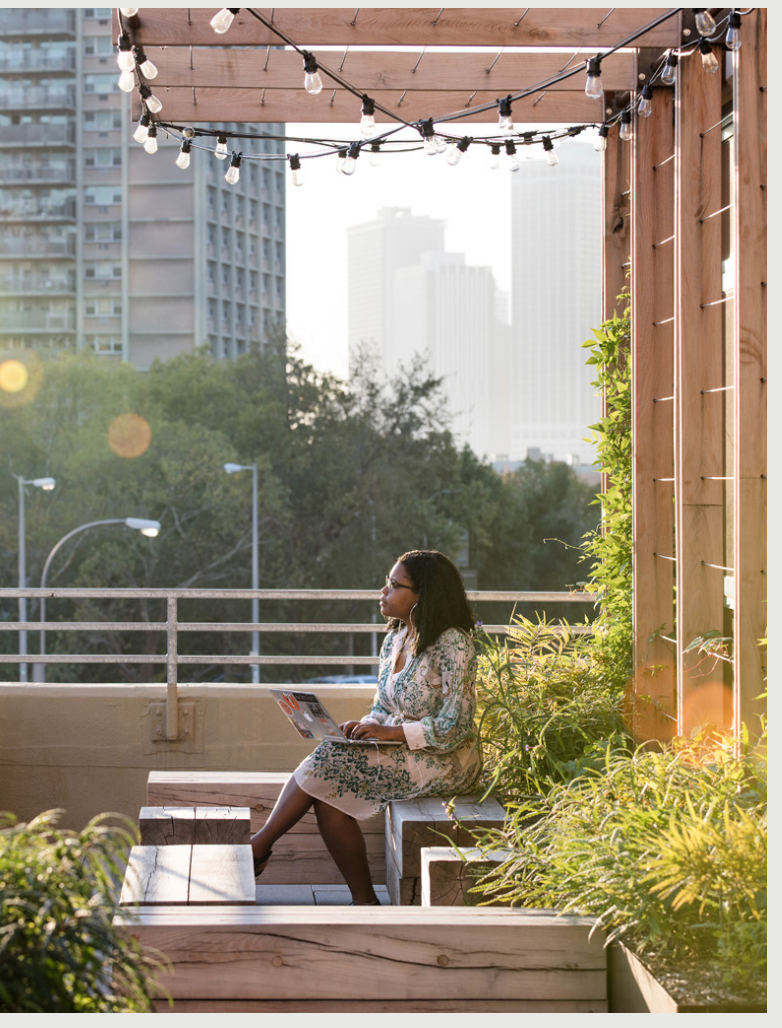
Etsy HQ, Brooklyn NY v3.0 Materials Petal Certified