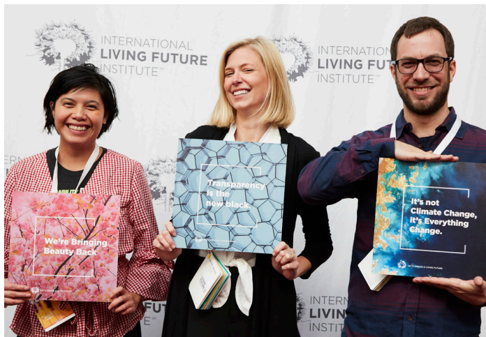
International Living Future Institute

Have you already completed some General LFA CE credits, e.g. by attending our annual Living Future Conference? These credits can be applied to your LFA and will simply need to be self-reported in your Living Future Education account after you've enrolled in LFA.